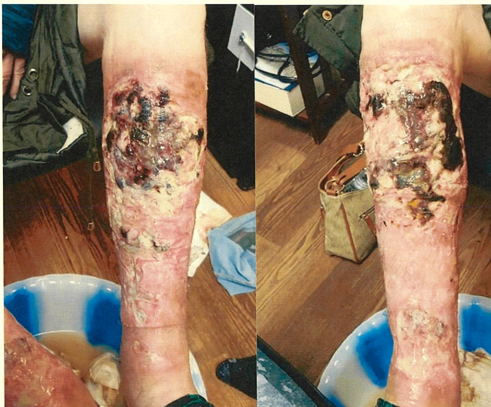
Figures 1 and 2. Skin ulcers caused by xylazine. Malayala SV, Papudesi BN, Bobb R, Wimbush A. Xylazine-Induced Skin Ulcers in a Person Who Injects Drugs in Philadelphia, Pennsylvania, USA. Cureus . 2022 Aug 19;14(8):e28160. doi: 10.7759/cureus.28160. PMID: 36148197; PMCID: PMC9482722.

WHEREAS , xylazine may be accompanied by skin ulcers with wounds that excrete pus, have decaying tissue and bacterial infections, which can lead to amputation at higher rates than those who inject other drugs. See Figures 1 and 2. Heroin and xylazine have some similar pharmacological effects including bradycardia, hypotension, central nervous system depression, and respiratory depression; and